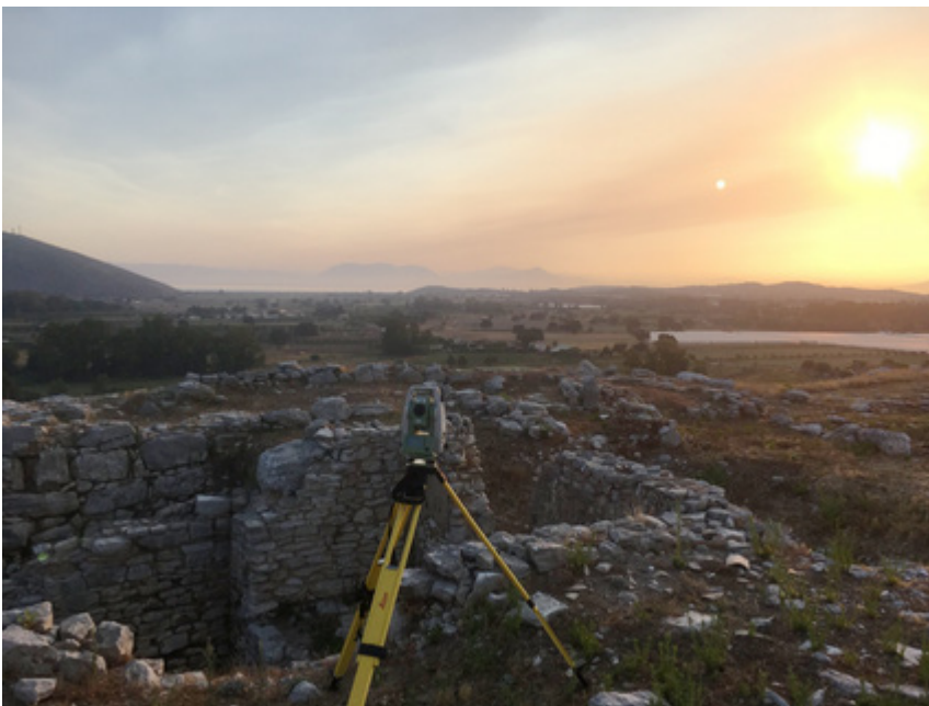
Teichos Dymaion, a Classical to Roman settlement in Araxos in Achaia Peloponnese.

I've been primarily concentrating on writing lately. I have roughly three-quarters of my dissertation monograph in draft form, which I hope to submit for a defense late next year. The BuzzFeed tagline would be "cheap tombs to remember your friendly neighborhood warlord by." Apart from my dissertation writing, I have an edited volume paper coming out soon in which I revisit the Moundville palisade en route to some limited comments on expanding earthmoving labour rates. I also assist with teaching an ANT107 clone course called Past and Future and a master's seminar on material culture studies (covering the earthmoving lecture, what else), and I sit on the editorial board for an in-house journal of undergraduate research.