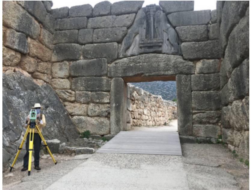
Daniel Turner working at Mycenae.

Currently I'm building a database of photogrammetric tomb models resulting from two summers of fieldwork in Greece. I took approximately 42,000 photos and 60,000 measurements covering a total of 94 structures, which primarily consists of chamber tombs from the Late Bronze Age cemeteries of Voudeni and Portes in Achaia and the monumental Tholos Tomb of Menidi near Athens. While many tombs are spacious, others trigger fears of small spaces, bats, spiders, and a monolingual site guard's repeated warnings of "σεισμός" (from which we derive seismic ), pointing at the crushing weights over our heads. Dull moments were rare. I've modified the labor cost models to which Dr. Blitz introduced me in 2009/10, focusing exclusively on earthmoving and with some added digital flair and UK spelling conventions.