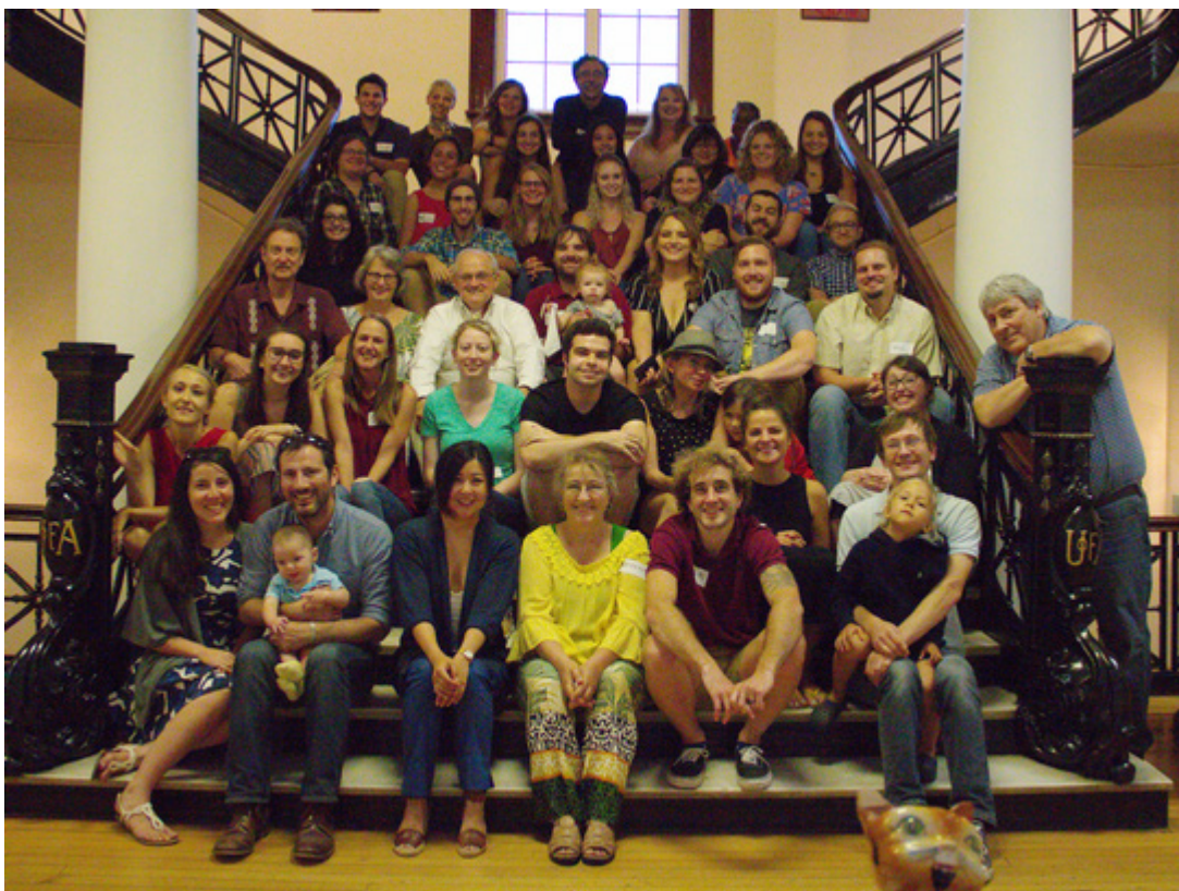
Annual department Potlatch, with sacred Boo-Boo Kitty in the foreground.