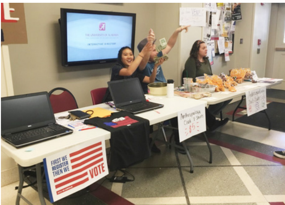
The Anthropology Club bake sale and voter registration.

Fund, given by the SEAC Native American Affairs Liaison Committee, for him to travel to Oklahoma to present his research to the Choctaw Nation of Oklahoma.