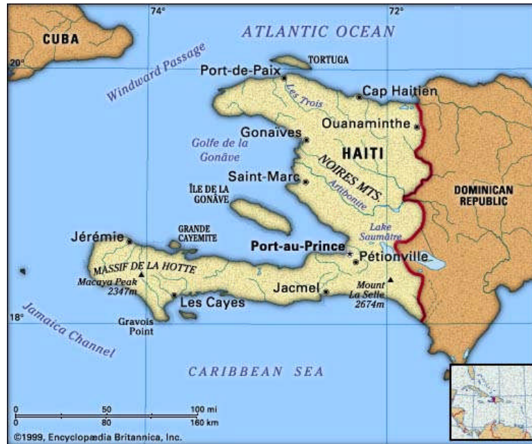
Figure 3 (Encyclopædia Britannica Online, 2008)